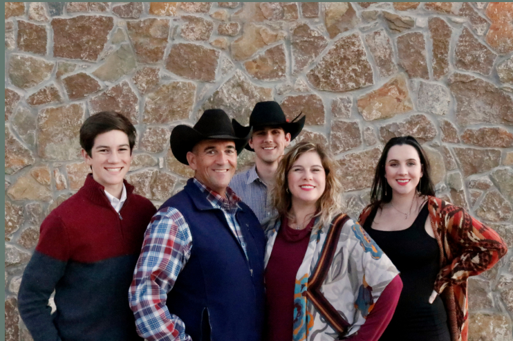
Collection II $375

30 Minute Photo Session 40 Retouched Images Private Gallery Print Release