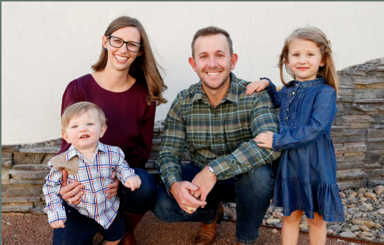
Collection I $250

30 Minute Photo Session 40 Retouched Images Private Gallery Print Release